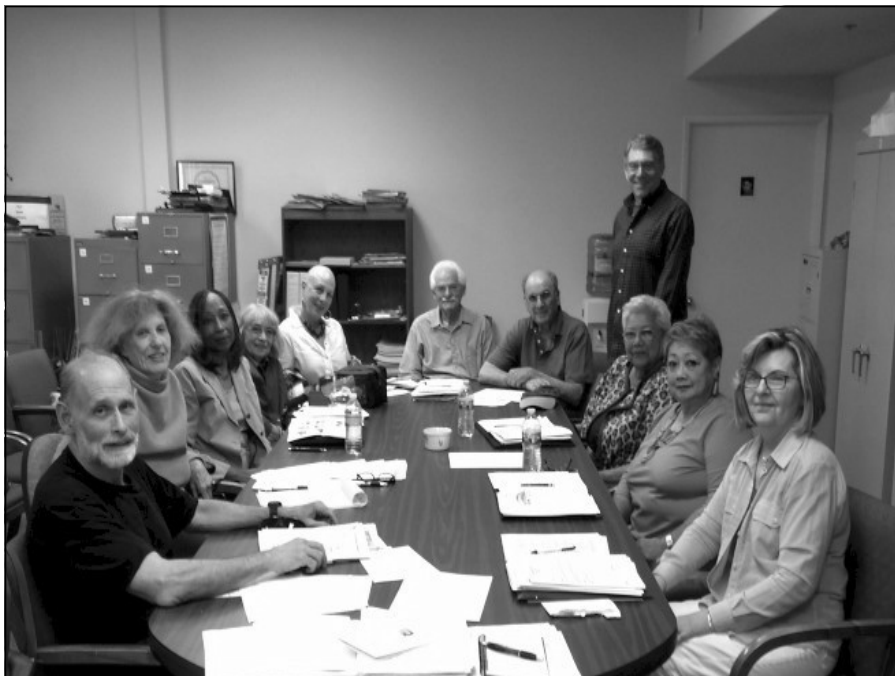
The PRO Board at its regular monthly meeting held on July 10, 2013.