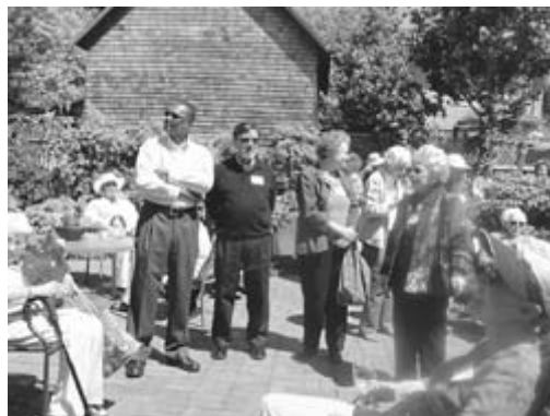
A group of retirees anticipating the outcome of the Garden Party raffle